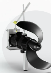
Wilo-Fluemen OPTI-TR 60-3