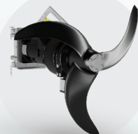
Wilo-Fluemen OPTI-TR 120-1