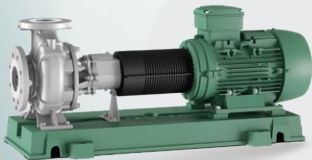
Wilo-Atmos GIGA NHT