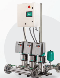
Wilo-Packaged Pump Set