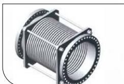
Single Type Expansion Joint- Tied (MST)