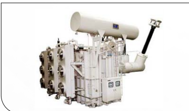
H.V Power Transformer