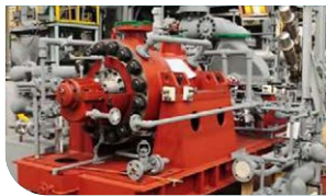
Horizontal HP Pump