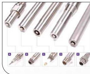
Spark Exciter(DC Type)