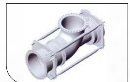
Pressure Balanced Type Expansion Joint (MSB)