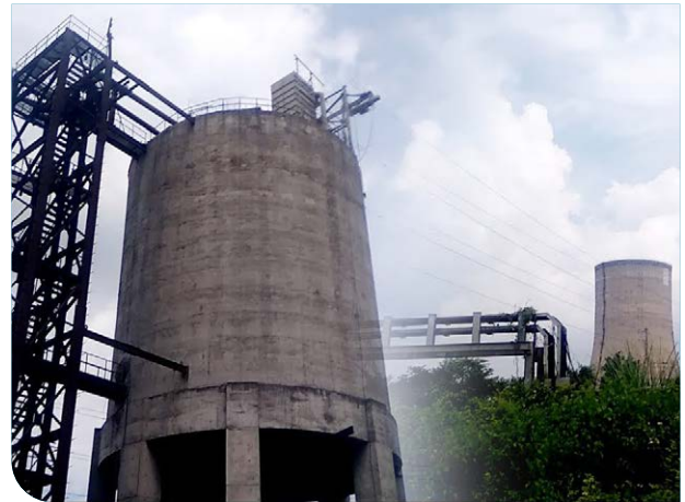
Ash Handling System