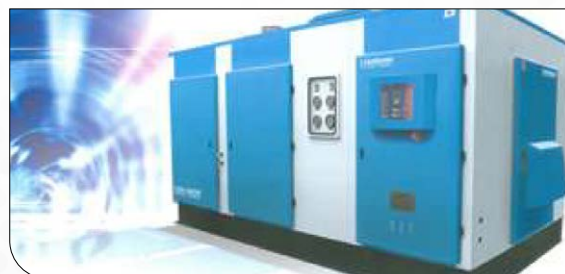
Oil-free Double Stage Screw Compressor