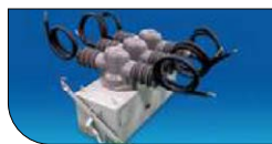
Polymeric Insulated Load Break Switch Overhead Line