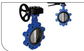
Manual Butterfly Valve