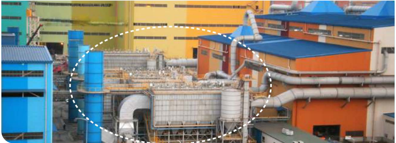
EPC Turn-key supply of Air Pollution control facility