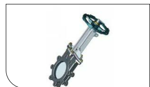
Knife Gate Valve