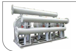
Oblong(Plate & Shell) Heat Exchanger