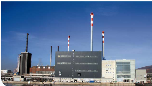
SCR Catalyst System(De-NOx)