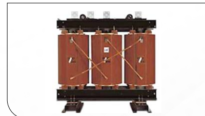
High Performance Mold Transformer