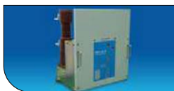
Vacuum Circuit Breaker