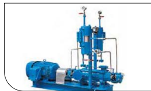
High Pressure Feed Water Pump