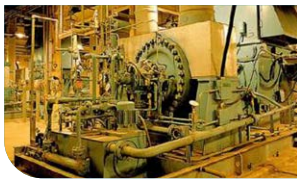
Horizontal Double Suction Pump