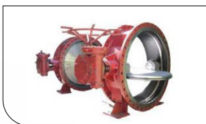
Water Works Type Butterfly Valve