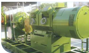
Double Suction Pump