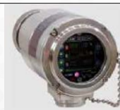
Integral Type (Sensor + Monitor)