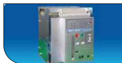
Air Circuit Breaker