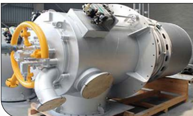
3-Stage Low Nox Main Burner