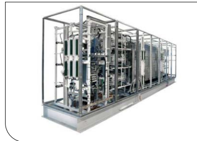
Medium Voltage Ac Drives