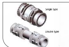
Gimbal Type Expansion Joint (MSG)