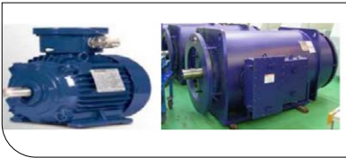
Explosion Proof Motors