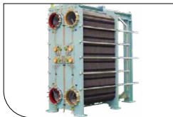
Plate & Frame Heat Exchanger