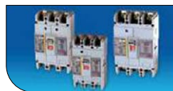
Molded Case Circuit Breaker & Earth Leakage Circuit Breaker