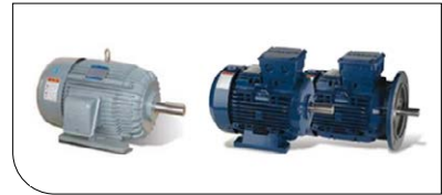
Low Voltage Motors