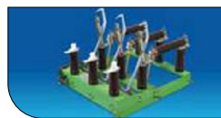
Load Break Switch with Fuse