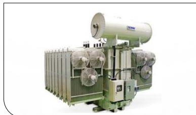
M.V Power Transformer