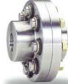
Flexible Flanged Couplings