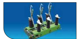
Automatic Sectionalizing Switch