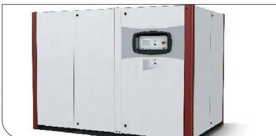
Oilfree Screw Compressor