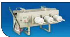
Pole mounted Gas Insulated Load Break Switch