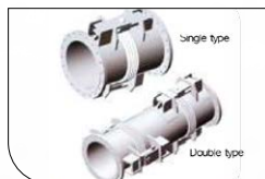
Hinge Type Expansion Joint (MSH)