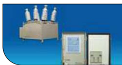
Automatic Circuit Recloser