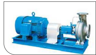
ISO Process Pump