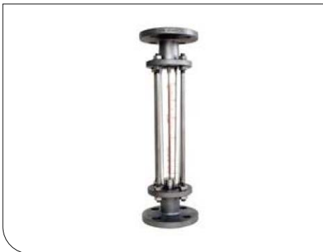
Variable Area Flowmeter