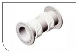
Universal Type Expansion Joint-Un Tied (MUN)