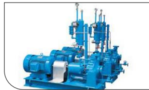
Api Process Pump