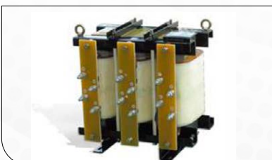
Motor Starting Reactor