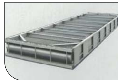
Waste Heat Recovery System