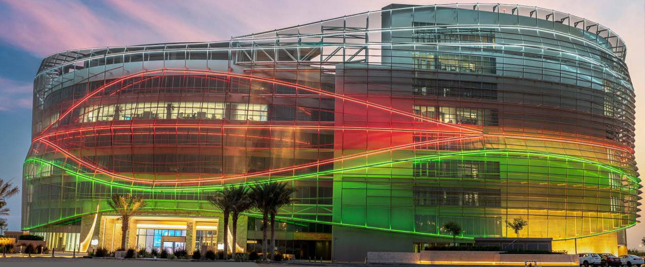
Omantel Headquarters Project - Muscat, Oman