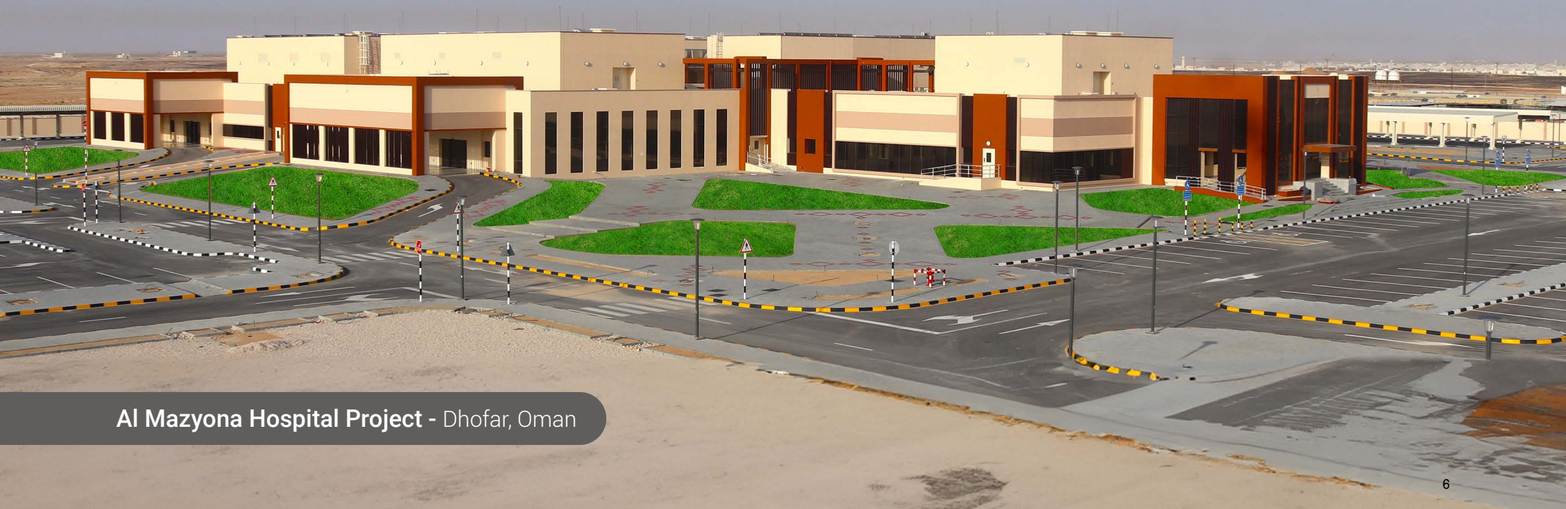
Al Mazyona Hospital Project - Dhofar, Oman